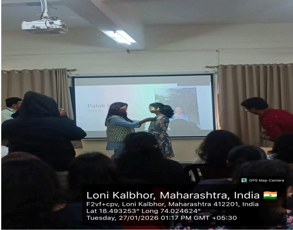
Loni Kalbhor, Maharashtra, India F2vf+cpv, Loni Kalbhor, Maharashtra 412201, India Lat 18.493253° Long 74.024624° Tuesday, 27/01/2026 01:17 PM GMT +05:30